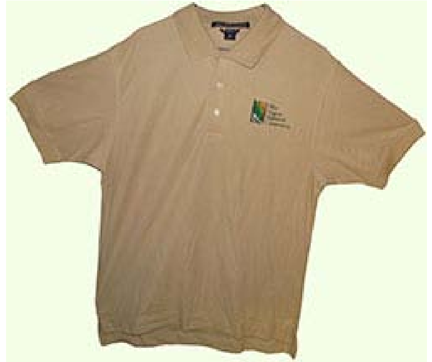
The Polo Shirt

(No model available. Applications still being accepted. So far we have no applications for the model positions)