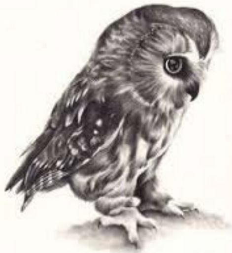
Saw Whet Owl

The second hooter is the Barred Owl. Heard fairly regularly in daytime, this handsome brown-eyed bird has many vocalizations. Its main call has been said to resemble the words, "Who cooks for you...who cooks for you-all?" with a drawn out hoo-ahh on the end. But this can segue into deliciously fearsome variations with many a waver and repeat.