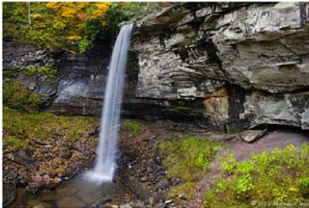
High Falls on Hills Creek