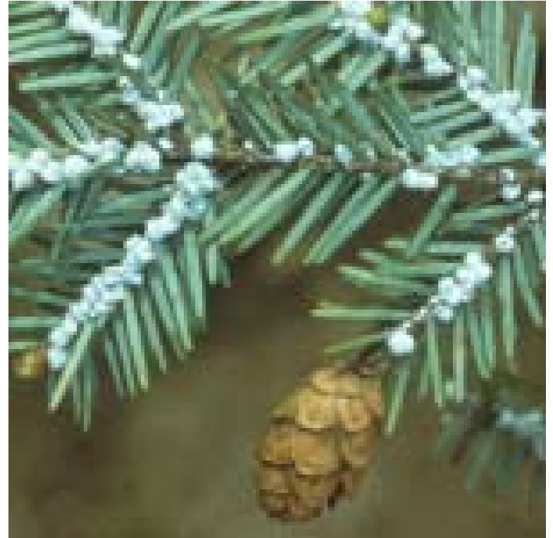
Hemlock Woolly Adelgid

Maybe some even went home to hoist a cold beer in honor of the forest---having been told that in the late 1800's the Anheuser Busch Company cut lumber in these woods. The oak for beer barrel staves came from the place that was to become Kanawha State Forest.